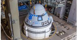
Boeing Starliner Orbital Flight Test-2