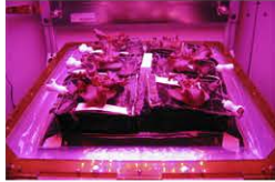
Resource Development aboard the ISS