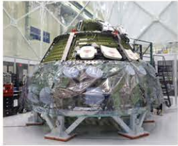
Orion Artemis II Crew Module Assembly at NASA KSC

America has made significant progress in manufacturing, testing, and launching key components of the Orion spacecraft, Space Launch System, commercial vehicles, as well as more scientific work aboard the ISS, all of which are helping make the Artemis program and deep space exploration possible.