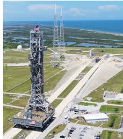
SLS Mobile Launcher