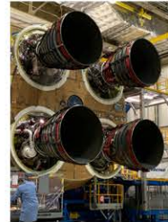
SLS RS-25 Engine Testing Complete & Four Flight Engines Installed on Artemis 1 Core Stage