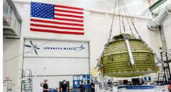
Orion Artemis III Spacecraft at O&C Building