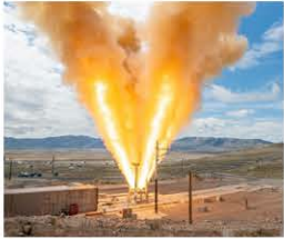
Successful Orion Abort Motor Test (Utah)