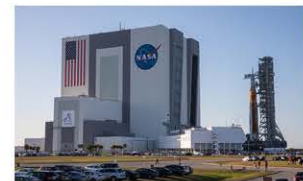
Artemis I Rolled Out to Launch Pad 39B for Wet Rehearsal